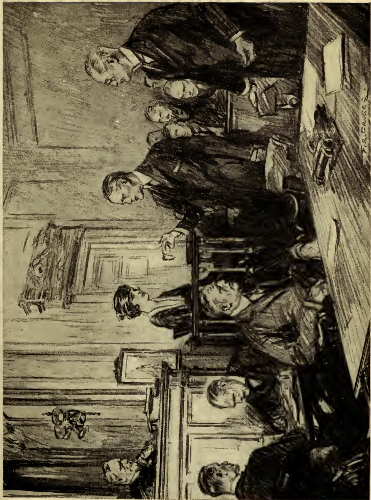
Lydia had seen the bracelet and shrunk from it